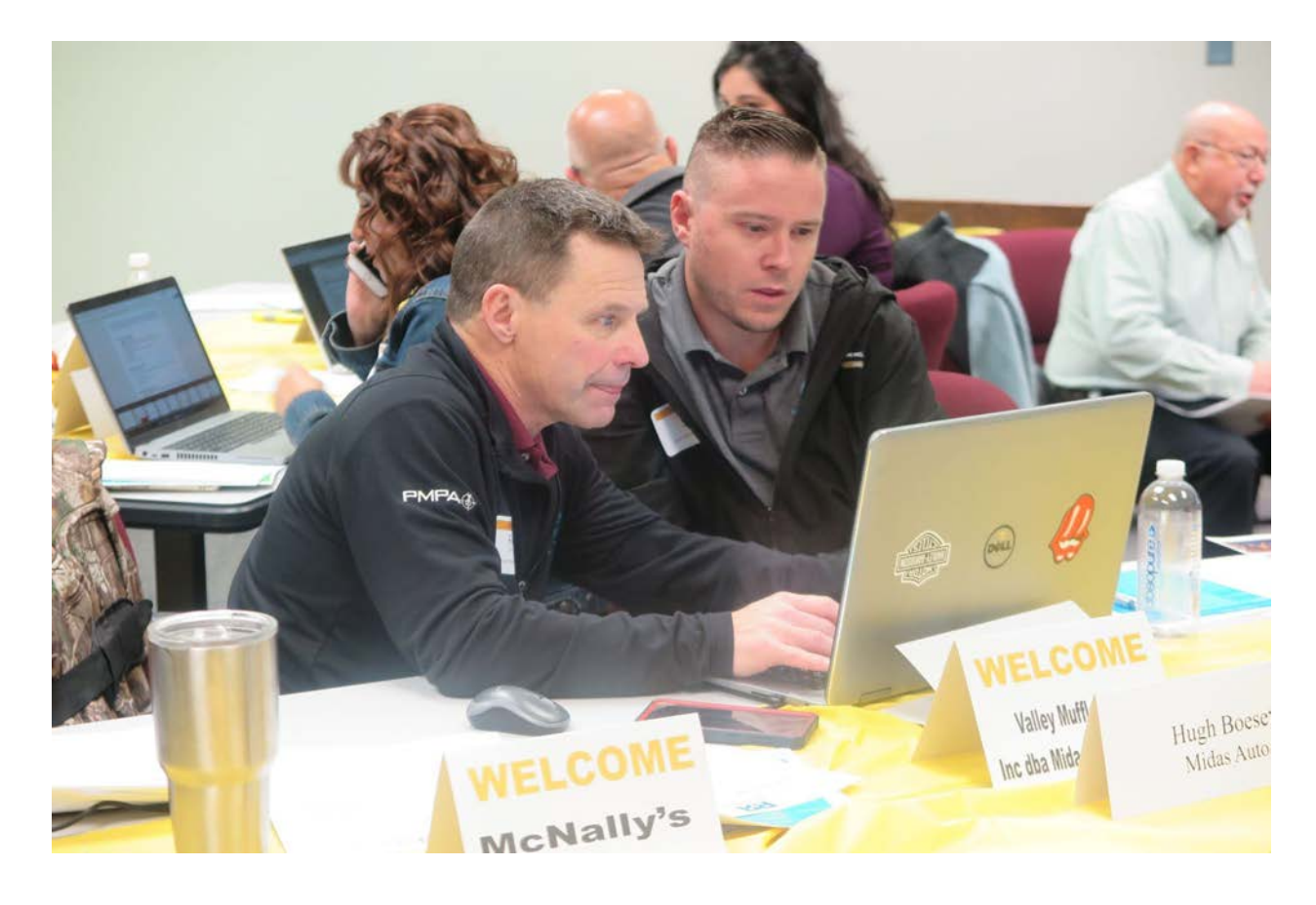
Business and Industry Teams