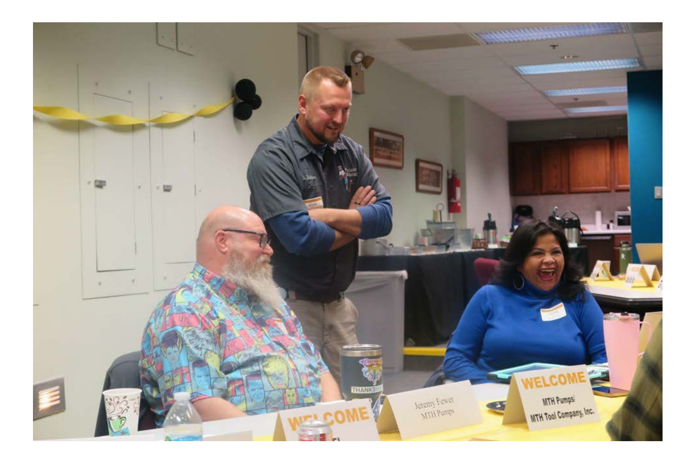
CTE Educator , WBL Coordinators , Counselor