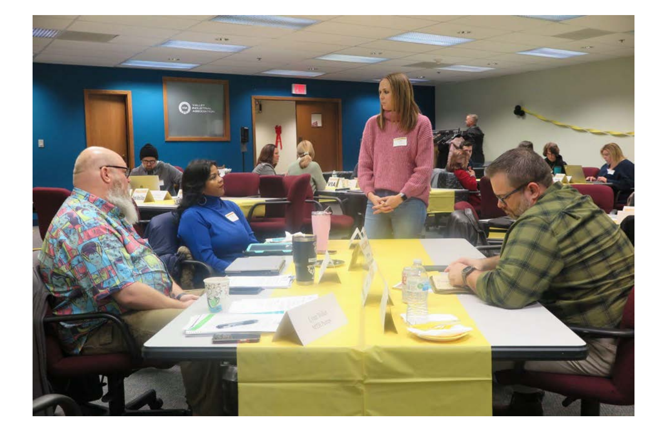
Grouping like industries