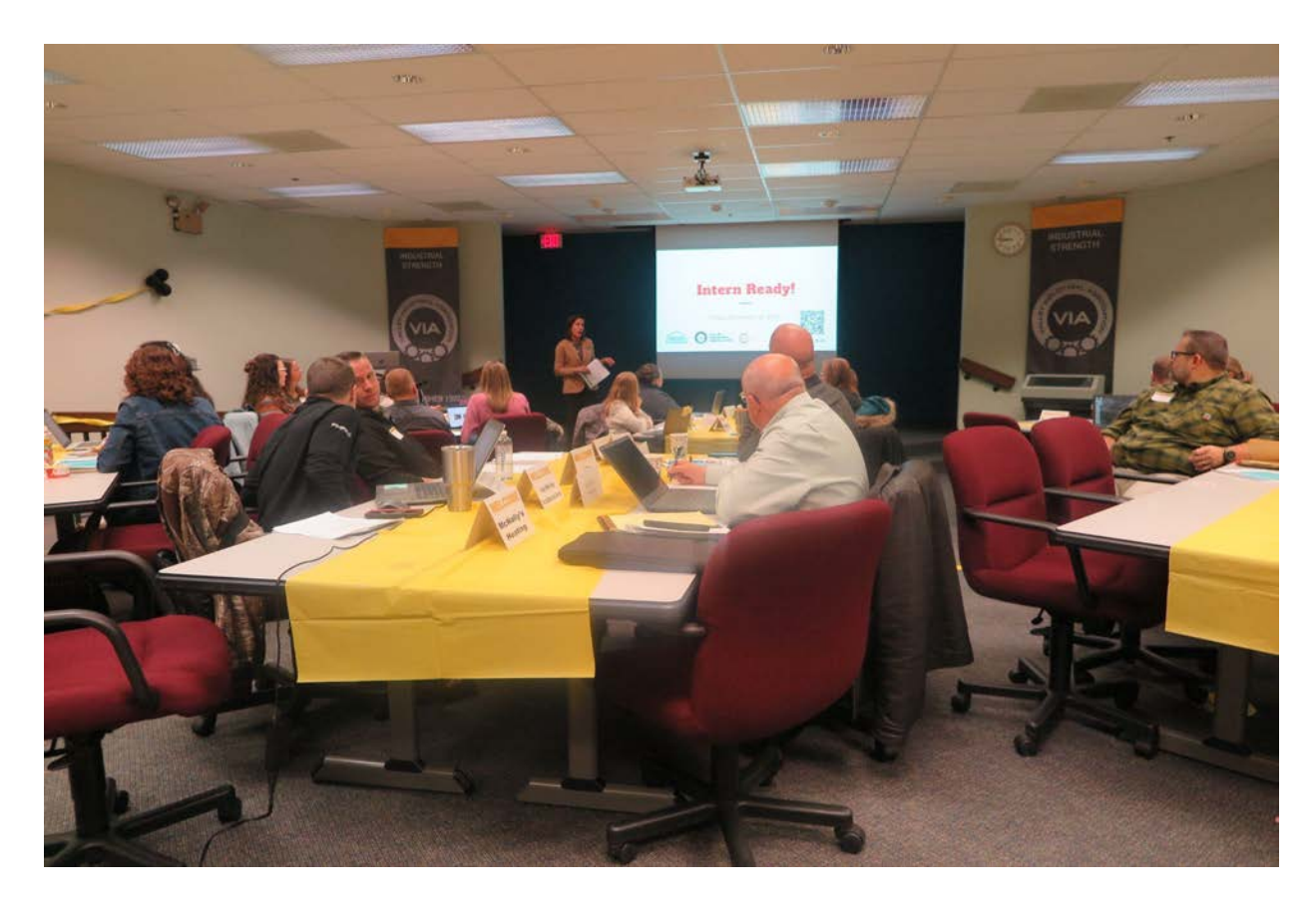
CTE Educator , WBL Coordinators , Counselor