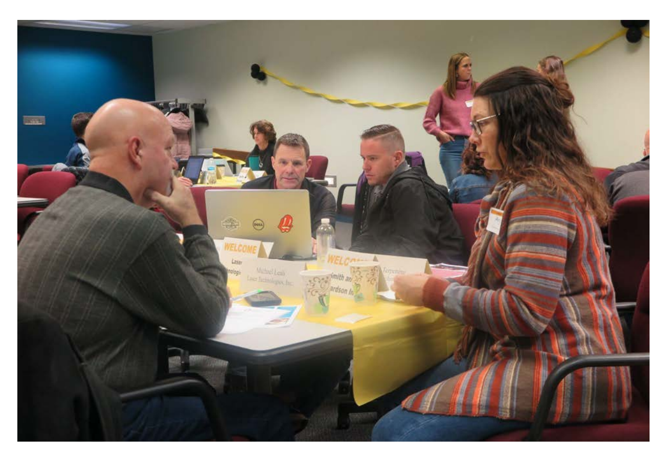
CTE Educator , WBL Coordinators , Counselor