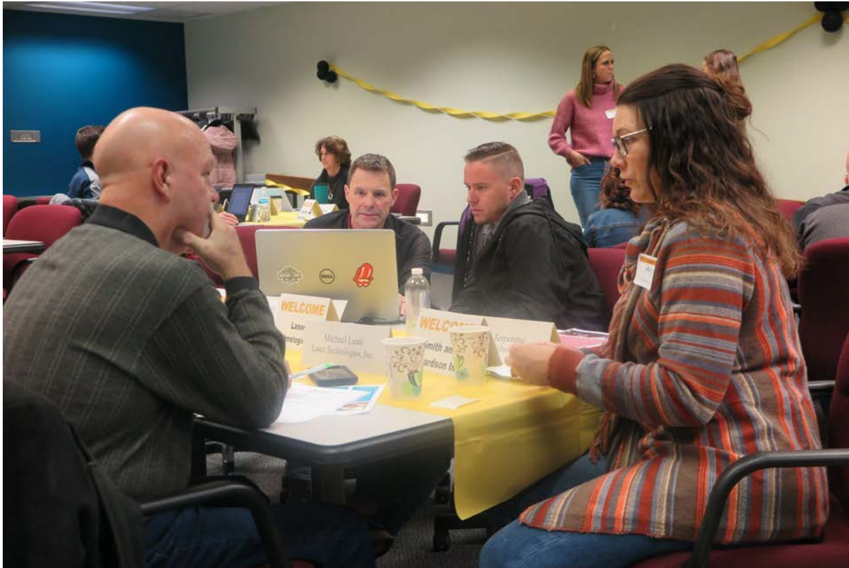
CTE Educator, WBL Coordinators, Counselor