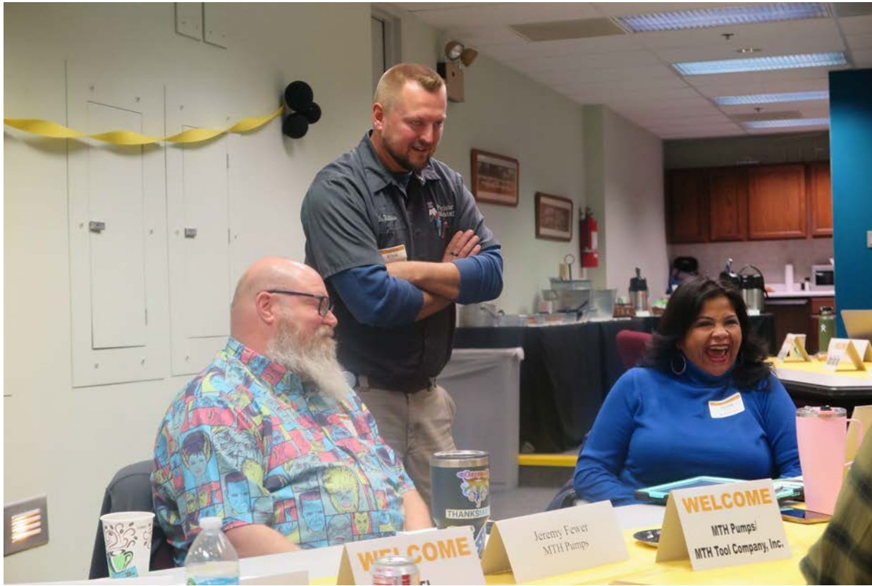
CTE Educator, WBL Coordinators, Counselor