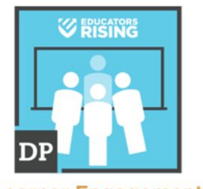
Anti-bias Instruction Classroom Culture Collabor